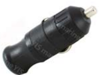
AP102 Mini Cigarette Lighter Plug