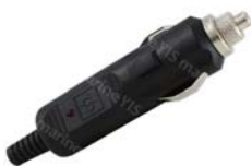
AP112 Deluxe Cigarette Lighter Plug