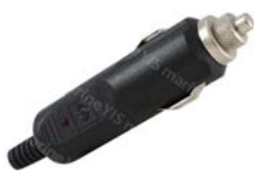
AP111 Deluxe Cigarette Lighter Plug