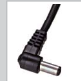
DC Plug (90°)