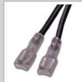
0.250"Female Quick Connect Terminal