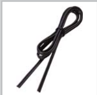
Straight Cord – 2C