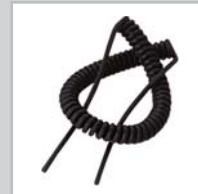
Coil Cord/ Round