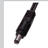
DC Plug (180°)