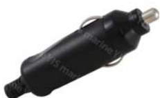
AP126 Cigarette Lighter Plug