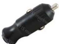
AP105 Mini Cig. Lighter Plug to DC Jack Adapter