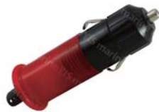
AP109 Illuminated Cigarette Lighter Plug with Fuse