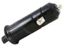
AP101 Bakelite Cigarette Lighter Plug with Fuse