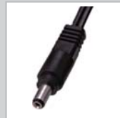
DC Plug (180°)