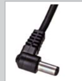
DC Plug (90°)